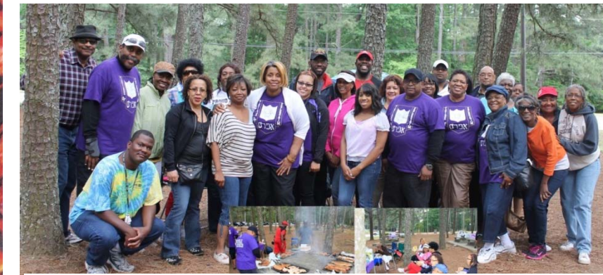
The Ephraim Tribe enjoyed a picnic at Stone Mountain Park May 17 th