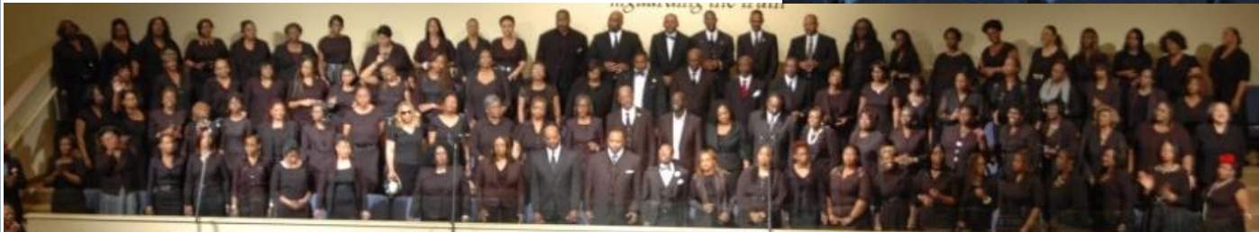
(Left) The choir stand was filled to capacity with representatives from each church.